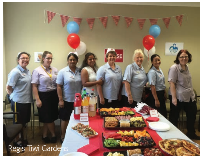
Regis Tiwi Gardens