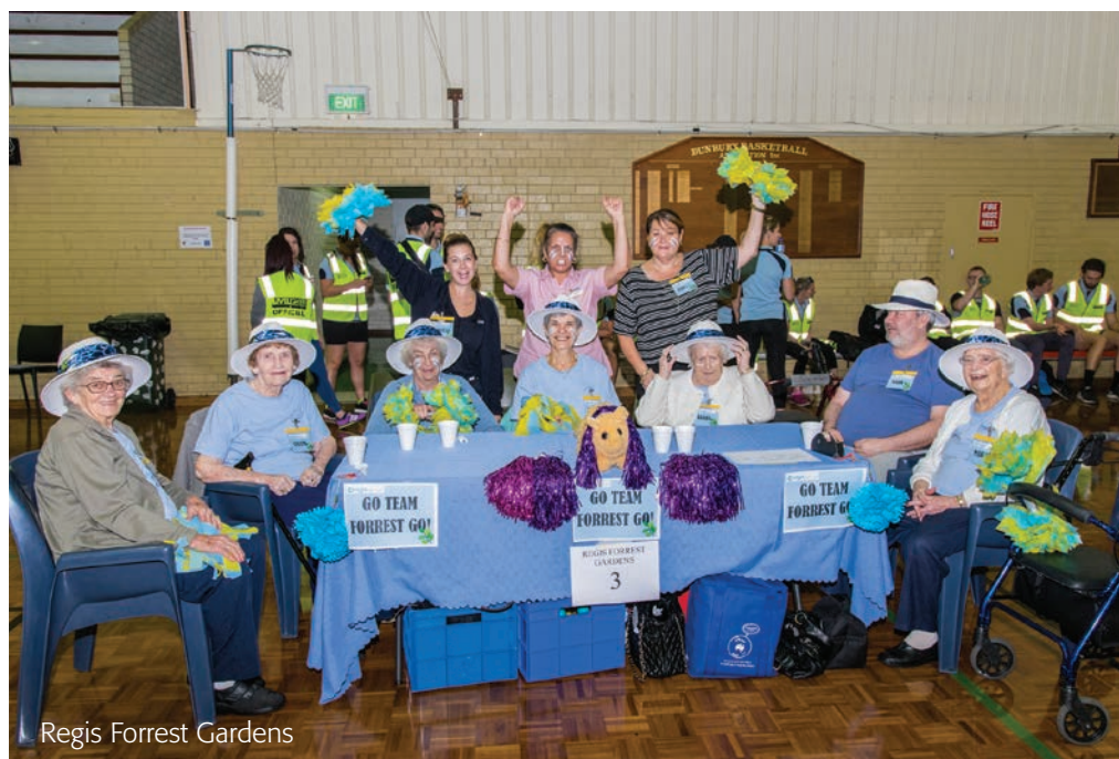
Regis Forrest Gardens

The month of April saw seven residents from Regis Forrest Gardens compete in the annual Live Lighter Aged Care Games. This year's games were held at the South West Sports Centre in Bunbury and were hotly contested by 10 aged care facility teams. Teams came together to compete and battle it out in such games as hookey, pass ball, bean bag toss and skittle. The day was filled with lots of laughter and fun. The competitive spirit was strong in 'Team Forrest' and everyone was a winner on the day.