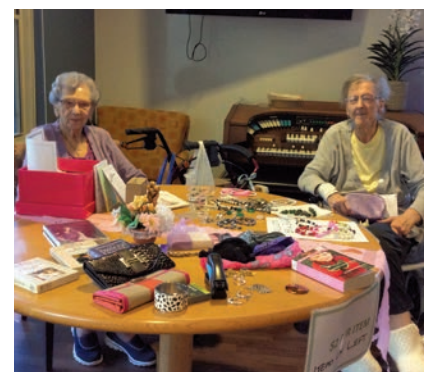
Sherwood Park residents attending the Twilight market

Around 150 to 200 people attended this event including residents, families, staff, volunteers and local community members. Residents loved the market atmosphere and the overall shopping experience. The market was such a success one is already being planned for November.