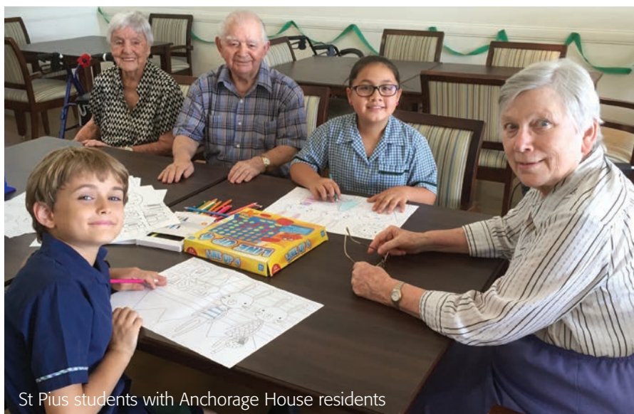
St Pius students with Anchorage House residents