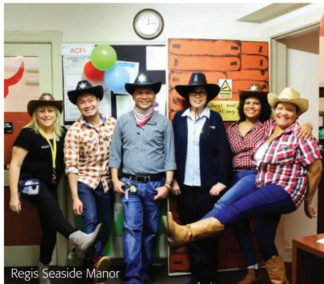
Regis Seaside Manor