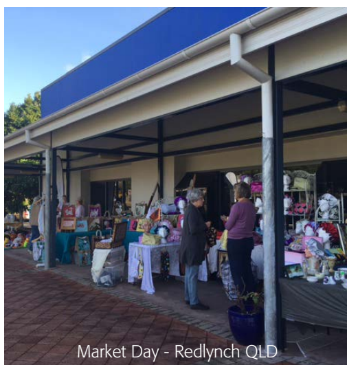
Market Day - Redlynch QLD

Regis Redlynch hosted their first Market Day on 6th August. The event offered a variety of wares with approximately 25 stalls on display which featured mostly handmade goods such as locally made arts and crafts, jewellery, candles, and bags. There were also stalls selling books, plants, clothes and origami. A free BBQ was held on the day along with tea and coffee for all attending. The Market Day was such a success they will host more in the coming months.