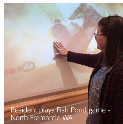
Resident plays Fish Pond game - North Fremantle WA

An interactive wall was recently set up for residents at North Fremantle. Residents can play interactive games with touch used to cause a reaction or move objects in the game. The fish pond screen is a favourite with an underwater scene of fish swimming-when the screen is touched; it creates a ripple effect and scares the fish which always gets a laugh. This new addition has received positive feedback residents and visiting family members who enjoy playing games together. During the day it remains on as residents are calmed by the images which appear on the screen saver.