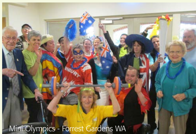
Mini-Olympics - Forrest Gardens WA