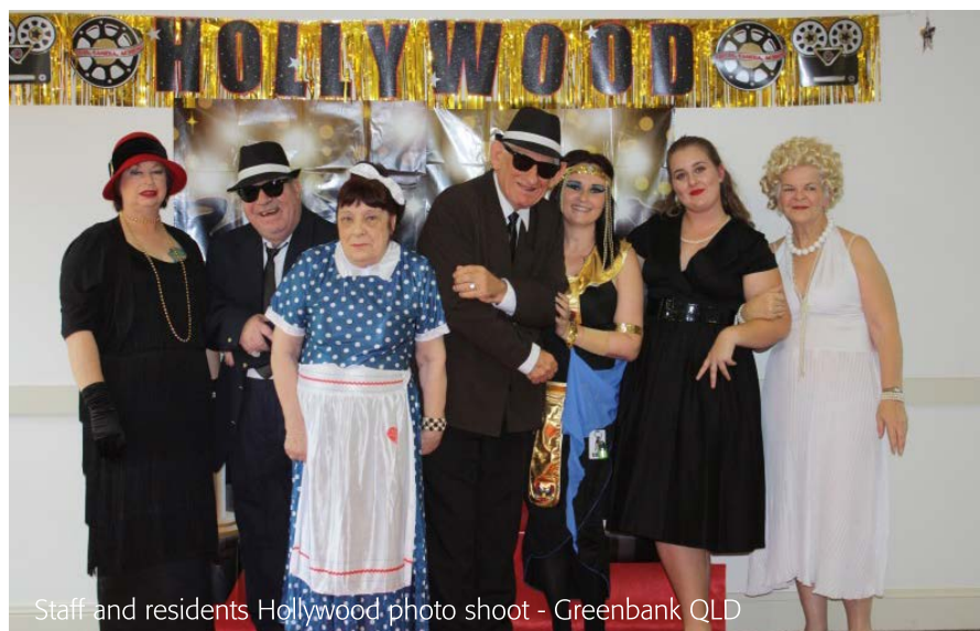
Staff and residents Hollywood photo shoot - Greenbank QLD