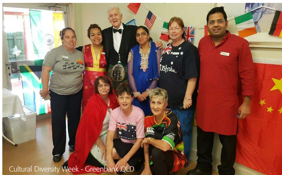
Cultural Diversity Week - Greenbank QLD