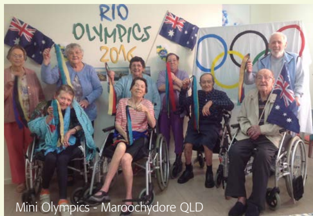
Mini-Olympics - Maroochydore QLD