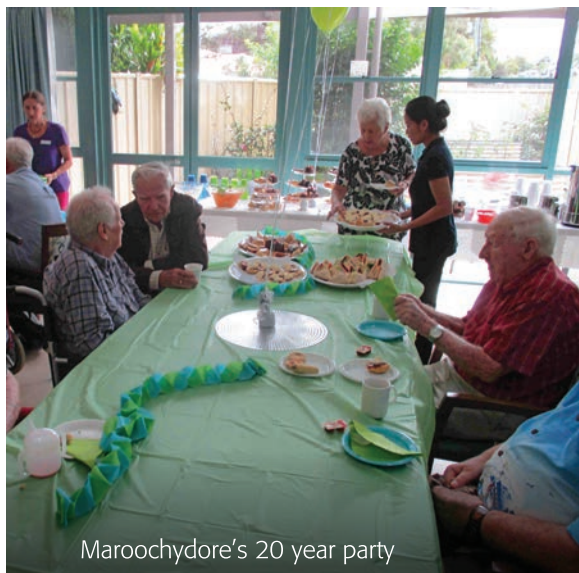
Maroochydore's 20 year party