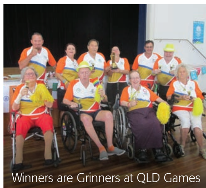
Winners are Grinners at QLD Games

The stakes were high between three of our Regis facilities in Queensland with their very own Seniors 'Commonwealth Games'. The competition was fierce between Greenbank, Salisbury and Gatton staff and residents. Everyone had fun, laughed (and cried) and came out as winners. Even Bunbury (WA) joined in our Commonwealth Games celebration with some belly-dancing entertainment.