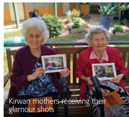
Kirwan mothers receiving their glamour shots

Regis celebrated all the mothers nationally at all our sites. Kirwan (QLD) went above and beyond to celebrate the day with a glamorous photo-shoot that was enjoyed by family, friends and residents alike. As a Mother's Day momentum, each of Kirwan's female residents received a framed copy of their professional portrait. While facilities, like Tiwi (NT) organised a beautiful High Tea for their residents and families.