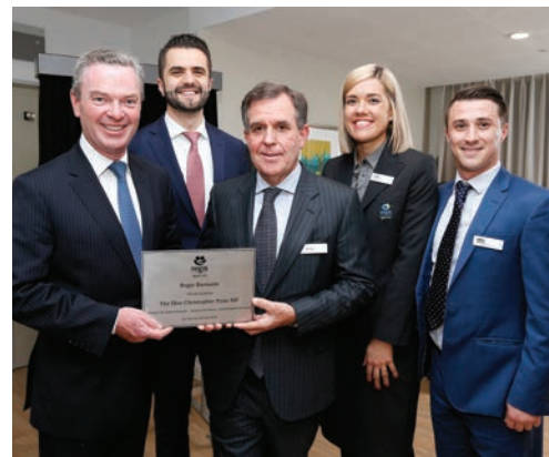
Regis team with Hon. Christopher Pyne (far left)

Regis recently celebrated the grand opening of Burnside's (SA) new extension with Federal MP, Hon. Christopher Pyne. Burnside's new Club build opened their doors in February 2018 and set a new benchmark with every stylish detail thoughtfully designed for both residents and families to enjoy. Offering the full range of aged care services, Burnside now provides Regis Club Services; an extra layer of superior services for those who appreciate the little extras. The service offers a cafe, cinema, hairdressing salon, private dining room, Wi-Fi and landscaped gardens for residents to enjoy.